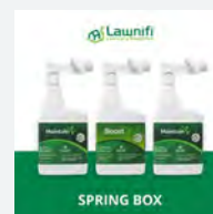
Lawnifi Spring Fertilizer Box