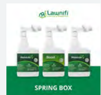
Lawnifi Spring Fertilizer Box